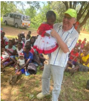
Visit by Young Mothers