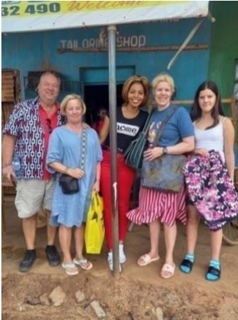
Appreciated tailor visit