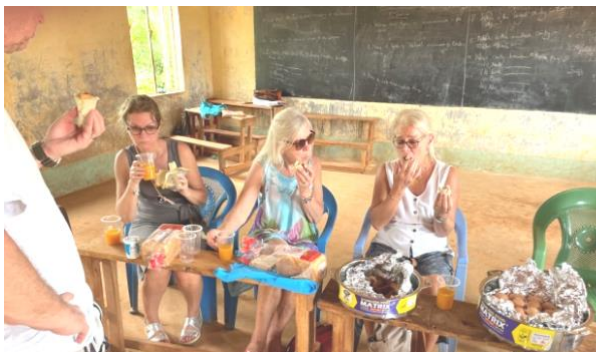
Picknick lunch at Mutha Primary School