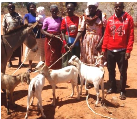
Christmas gifts in form of goats