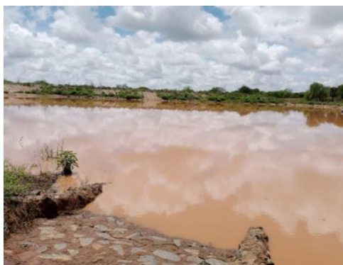
Waterland (22 miljoner liter vatten)

A good rainy season in November/December contributed to our own water dam on Waterland (22 million liters of water) flooded. This means that ongoing agricultural training for groups and tree planting will get off to a good start in 2024.