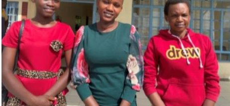
Example above, 3 girls are starting nurse training at Mutomo hospital. I met them

Primary School is SEK 2,400 /year and from Junior Secondary School (class 7) is SEK 4,800. The attentive person sees that former primary school has been extended by one year and upper secondary school has been shortened to 3 years. 3 semester system remains. All education beyond high school level is more expensive than SEK 4,800, but we have generally recommended seeing that amount as a contribution to college or university education. If you want to continue to support. In some cases, more expensive educations are fully supported by sponsors.