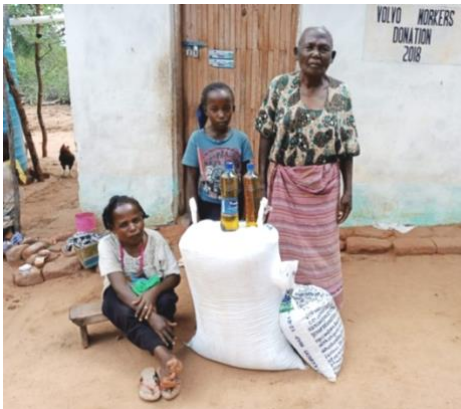
Christmas package á 500 SEK

A much-appreciated event before Christmas is the Mutomo project's distribution of Christmas gifts to selected families in need of help. Before Christmas 2023, we gave out 45 Christmas packages (value SEK 500). In addition, goats, chickens and donkeys. These gifts can be implemented thanks to gifts via gift certificates as well as unspecified gifts during the year. The gift vouchers are an excellent way to help the particularly vulnerable. See the website or contact the undersigned for more information.