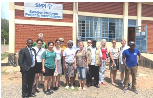
Business visit in our bakery.

Young Mothers that they support. Some wanted to buy animals (oxen, donkeys, goats) at the Saturday market for their sponsors and other needy people. Others wanted Kenya-inspired creations sewn up by a seamstress. Many tears were shed at the farewell and the group decided to see each other again after the journey home in March.